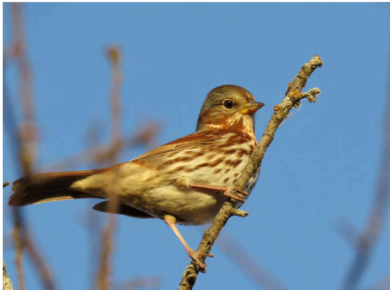
Fox Sparrow

Many birds that spend the winter in the southern U.S. and migrate through New York State in the spring—such as the fox sparrow—are arriving about a week earlier than they did in the late 1960s. 2