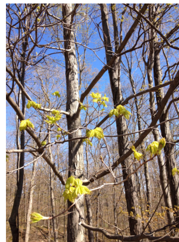
Sugar Maple leaves opening in spring at the Cayuga Nature Center

Central New York springs are getting warmer. Since 1950, average daily temperatures in spring have increased at a rate of about 0.4°F per decade. That adds up to about a 3°F total increase over the past 70 years.