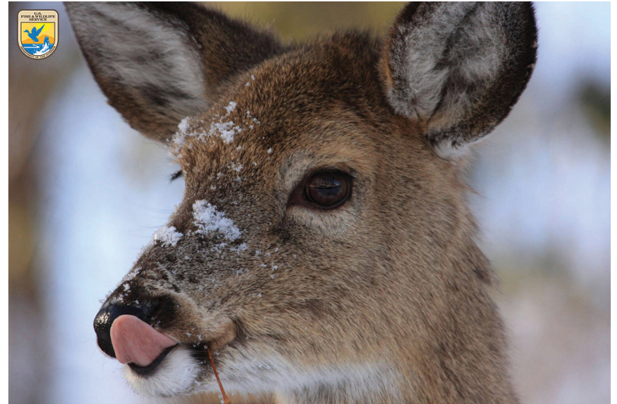
White-tailed deer.

You may have heard about climate change: our planet is warming, precipitation patterns are changing, and we're having more extreme weather. This is affecting humans in our daily lives and in planning for the future. But we're not alone—other animal species are feeling the impact of climate change, too.